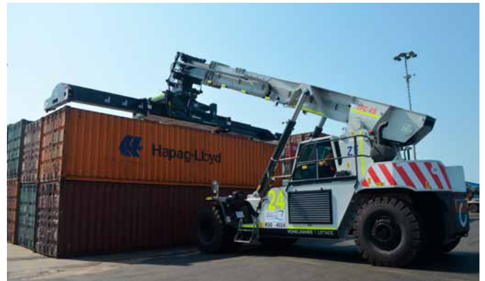
Konecranes Liftace reach stacker model TFC 45 HC handling containers at Puerto de Barranquilla in a standard working day

of safety, with advanced monitoring systems and excellent visibility. The vehicles can be fitted with dedicated lifting gear for general and special loads, making them fully adaptable to their working environment.